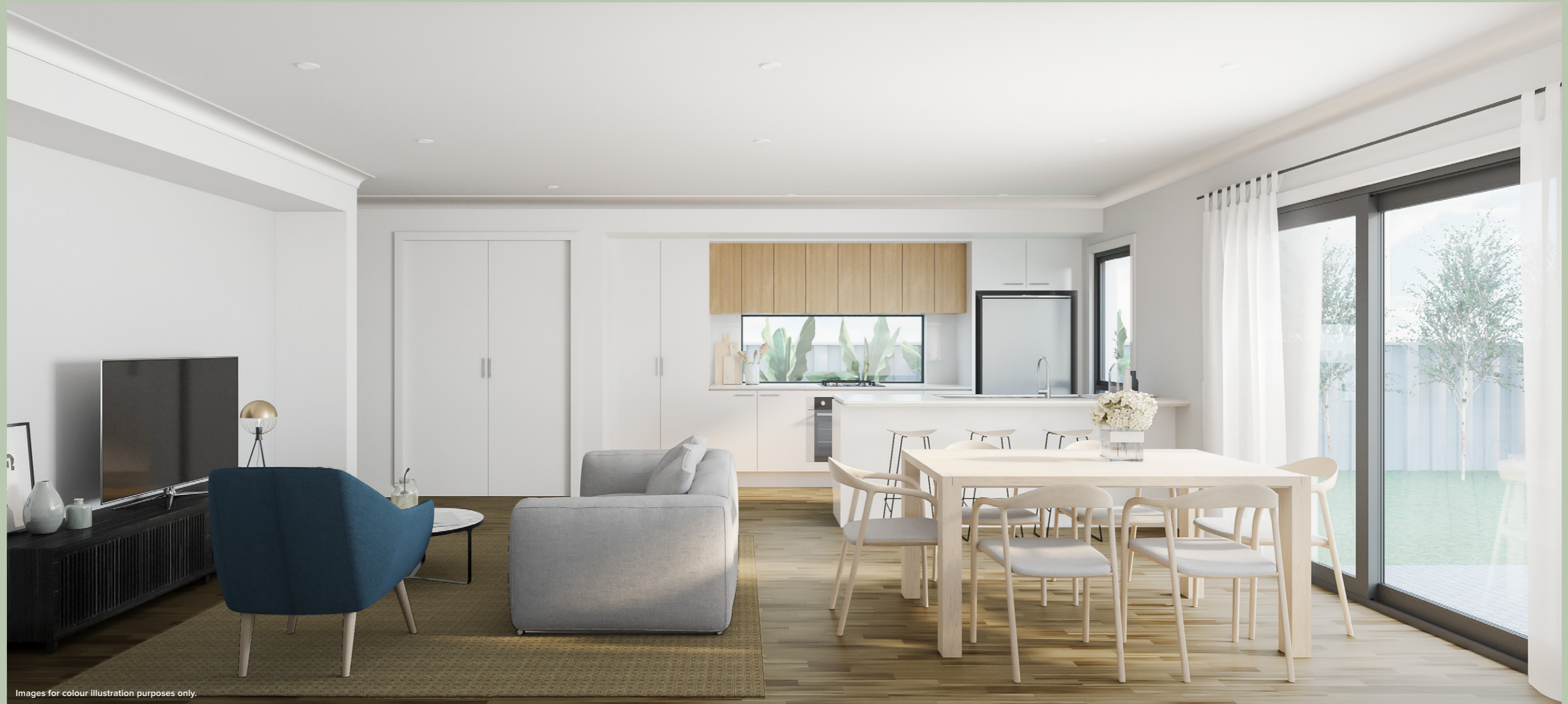
Images for colour illustration purposes only.