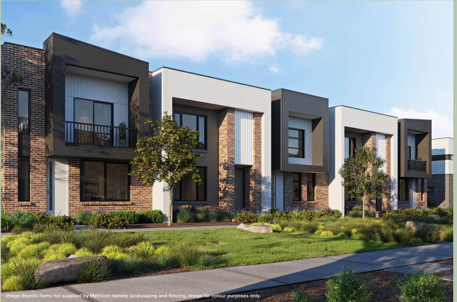
Image depicts items not supplied by Metricon namely landscaping and fencing. Image for colour purposes only.