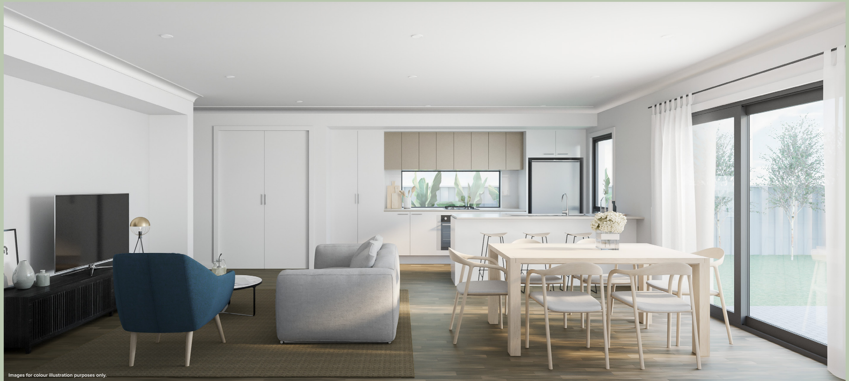
Images for colour illustration purposes only.