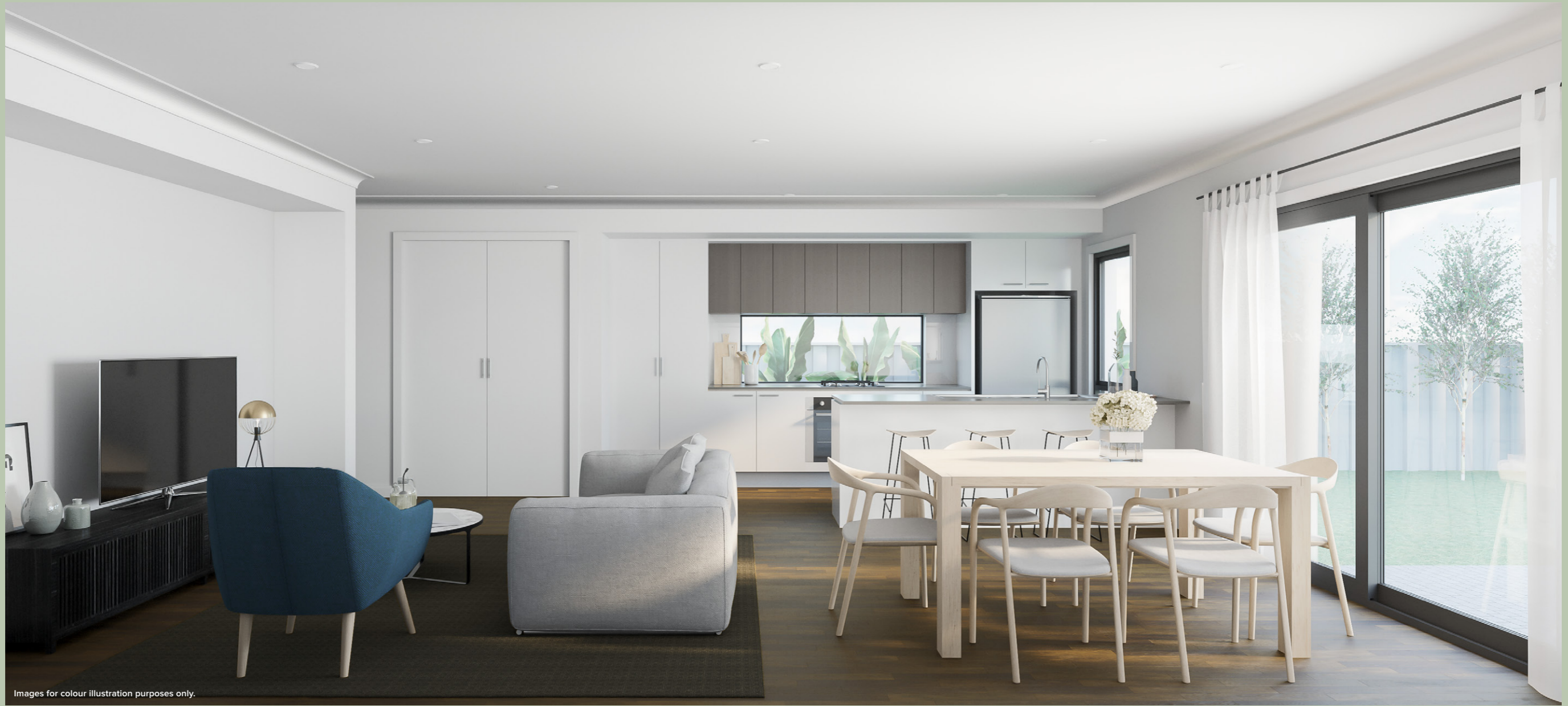
Images for colour illustration purposes only.