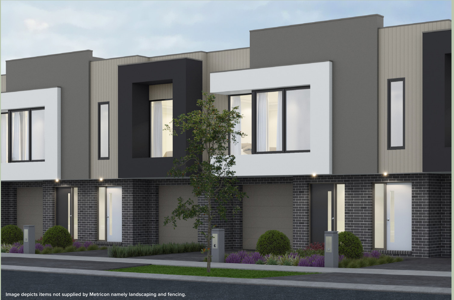
Image depicts items not supplied by Metricon namely landscaping and fencing.