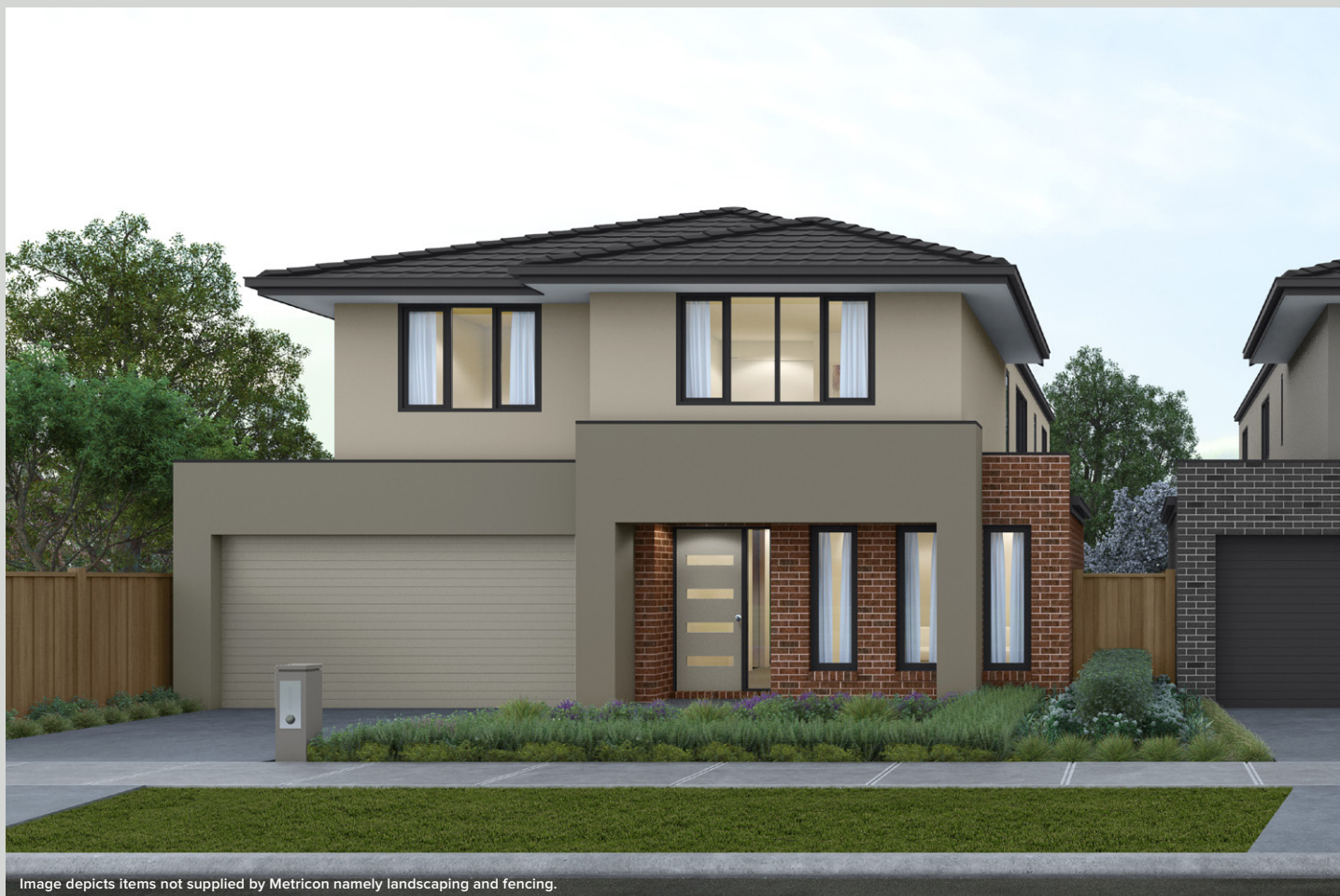
Image depicts items not supplied by Metricon namely landscaping and fencing.