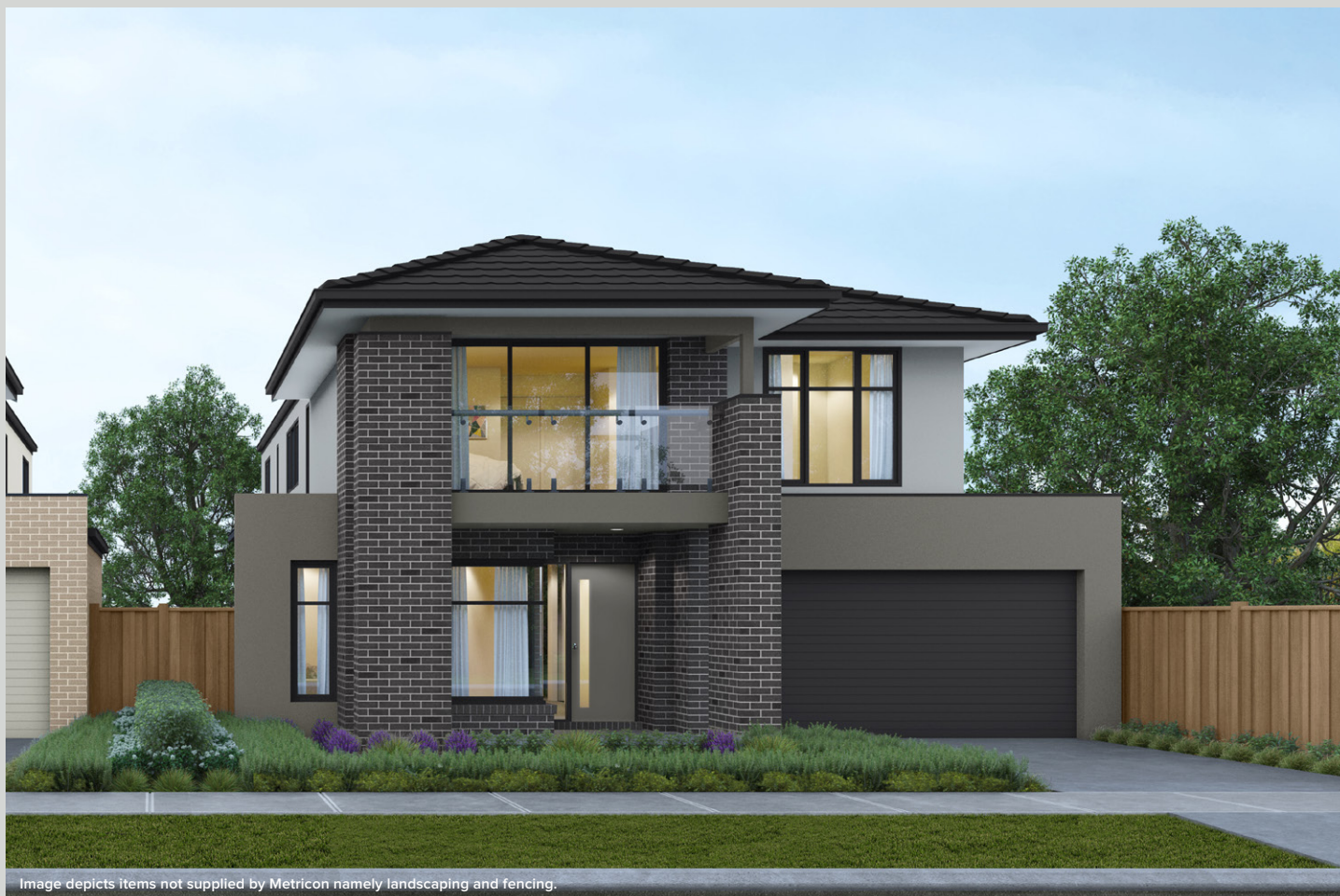
Image depicts items not supplied by Metricon namely landscaping and fencing.